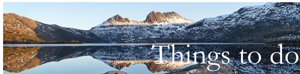
Cradle Mountain