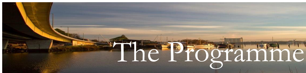
The Tamar River, Launceston

Venue for all events: Hotel Grand Chancellor, 29 Cameron Street, Launceston