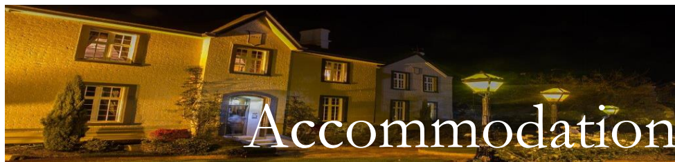
Colonial Motor Inn, Launceston